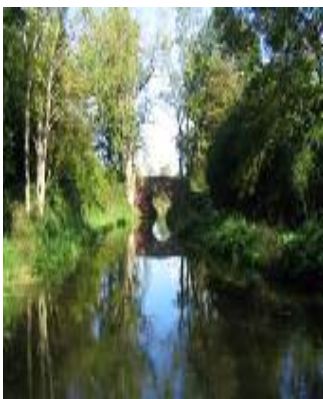
A peaceful scene on the Wey & Arun canal

The high level of interest shown by local residents at the exhibition in Bramley Village Hall last October really took us by surprise. Over 700 people attended the exhibition, which was many more than we had expected.