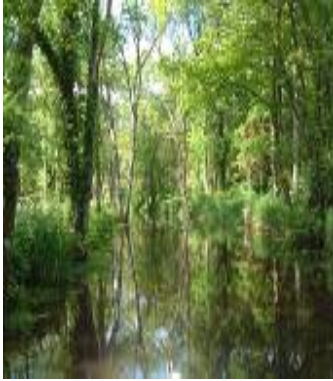
A restored section near Wisborough Green

century and a number of residential properties and properties, associated gardens and private land now block the original route.