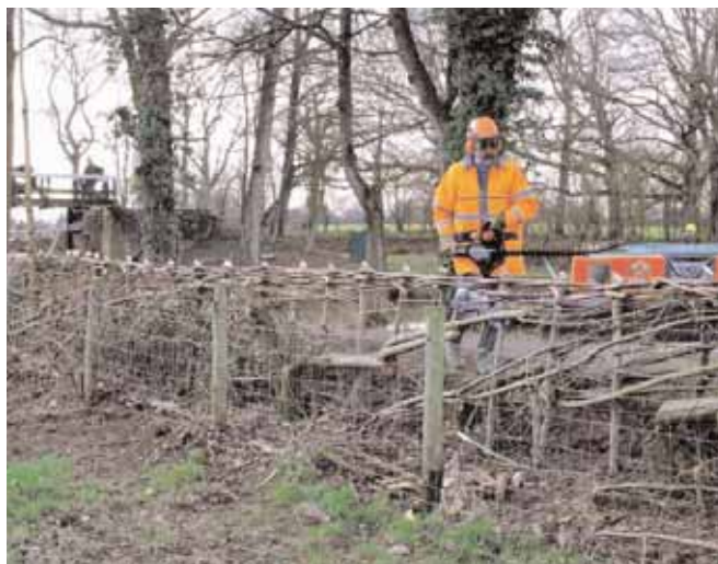
Hedge laying on the canal (Penny Line)